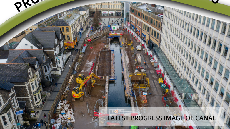
LATEST PROGRESS IMAGE OF CANAL

E: CHURCHILLWAY@KNIGHTSBROWN.CO.UK T: 07818 432183