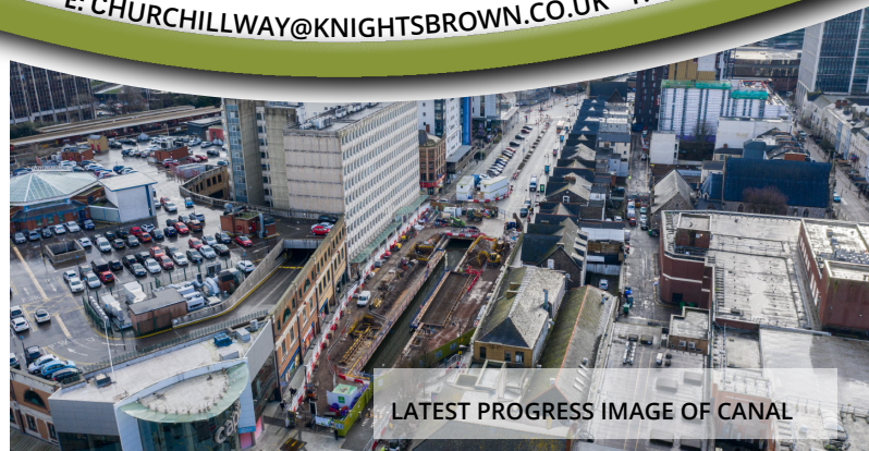
LATEST PROGRESS IMAGE OF CANAL